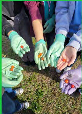
STEM Environmental Students enjoy their bounty!

★ FELLOWSHIP OF CHRISTIAN ATHLETES CLUB ★